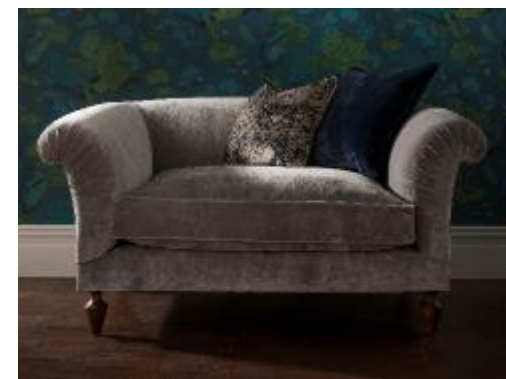
Displayed in Allure Opal with scatters in Opium Sapphire & Rio Midnight

Sizes are approximate and Spink & Edgar Upholstery reserves the right to alter specifications in the interest of improved quality. Every care has been taken to reproduce the colours as accurately as possible within the tolerances of the print process.